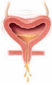
An overactive bladder squeezes too often